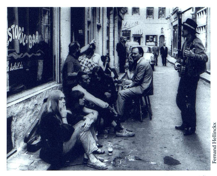
Busking in the Petite Rue des Bouchers, Brussels, near the Café Welkom, 1960s.

have sounded quite original to most listeners too, but it was mostly the man's brilliant charisma, and reassuring coolness that people noticed when they first met him. His deep, warm voice told the songs more than it sang them. His banjo style was most delicate and superbly clean (listen to his masterful rendition of "Pretty Little Miss"). The man was a born entertainer who could capture the most varied of audienceseven those with no inclination for the American idiom—with his infectious cheerfulness that was a subtle mix of humanity and tenderness plus a good pinch of humor. The icing on the cake was his kindness and a matchless touch of class. He was also, simply, a poet. Songs such as "The Sky," "The Mountain," "The Valley," and "Love Song" provide ample proof of his enormous talent. The apparent simplicity of his banjo style amplifies the clarity of his lyrics. This combination enabled him to go directly to the heart of the matter with seemingly very little effort, hitting home most of the time. And that is what makes